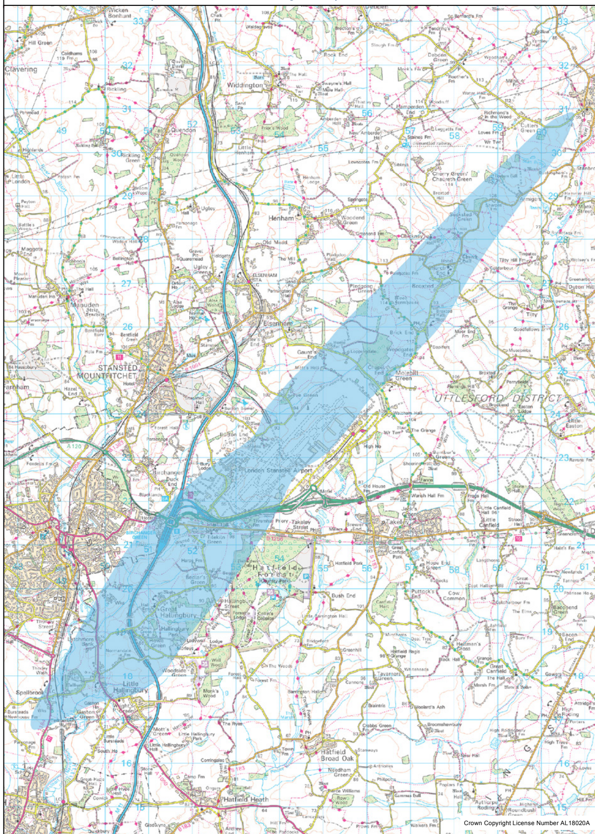
Stansted Airport Ltd Claims Relating to Airport Works from 1999 to 2007